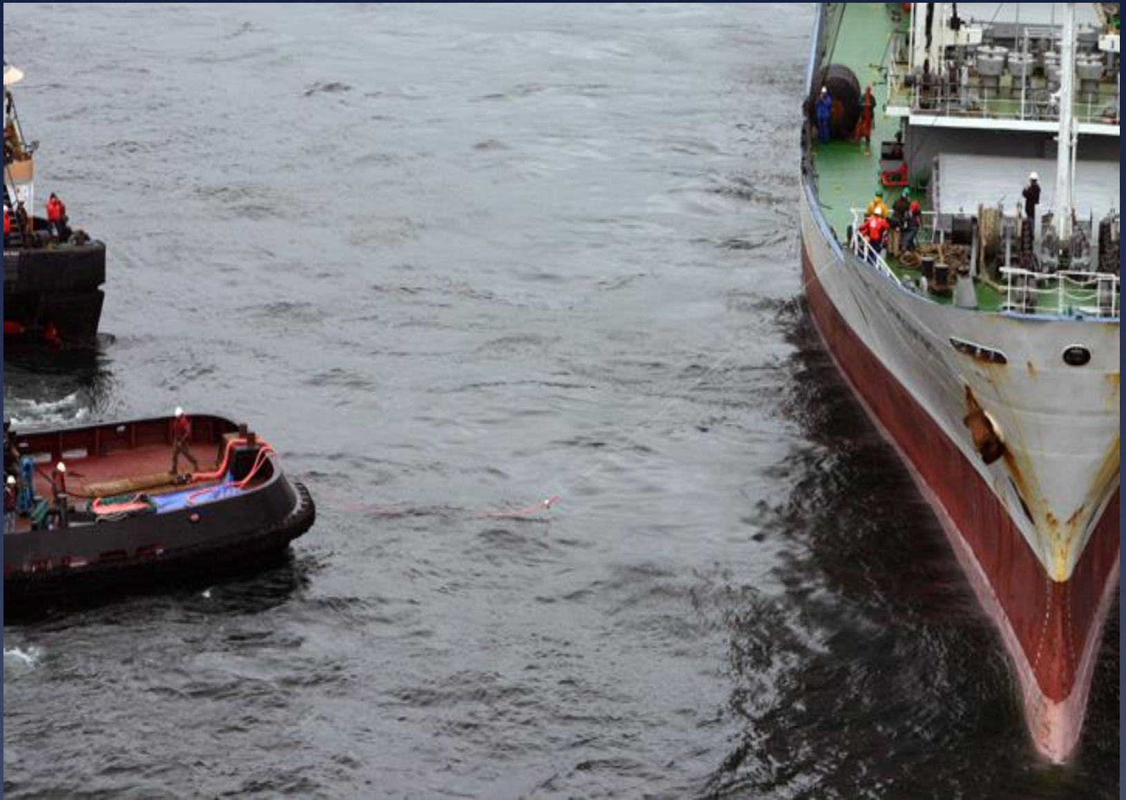
Tug to Ship Deployment