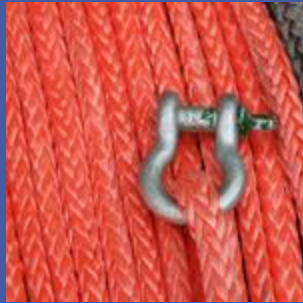
600' x 7/8" Spectra Messenger Line