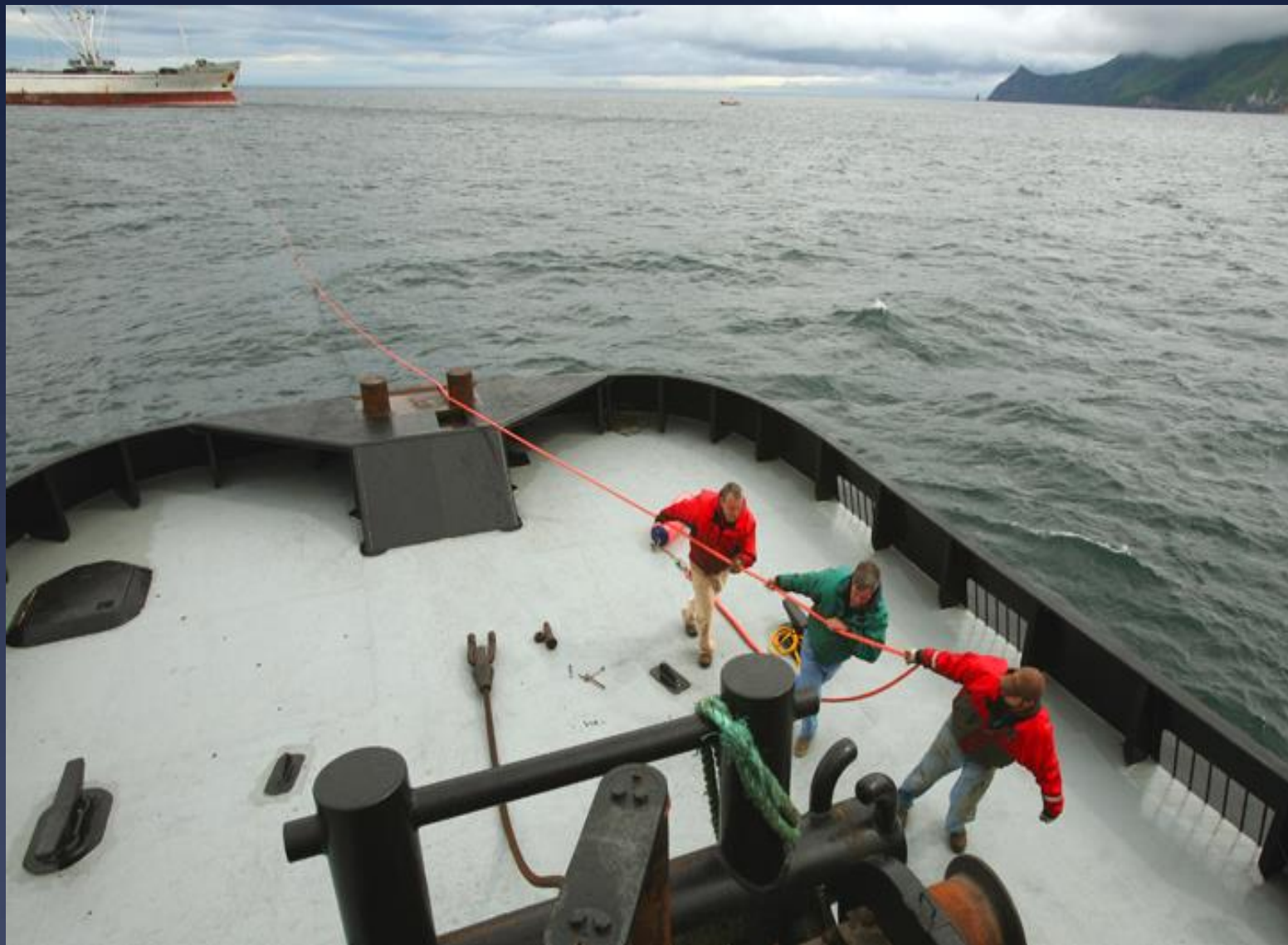
Ship to Tug