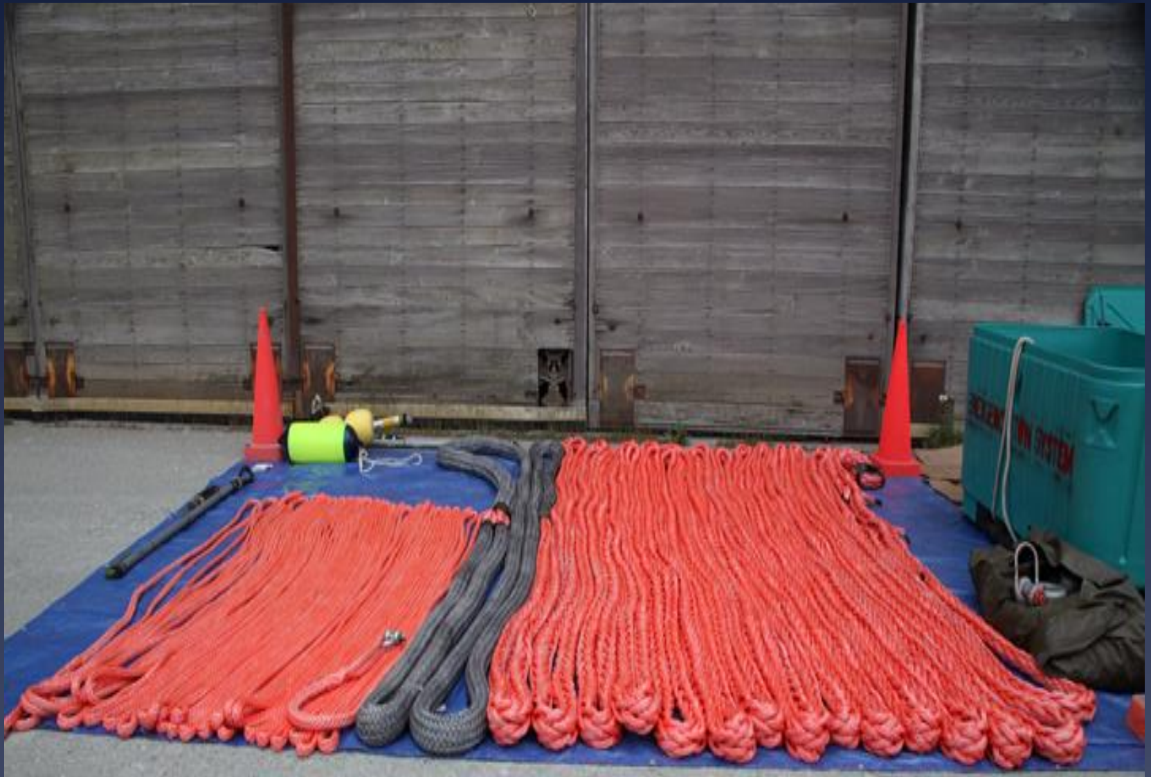
Emergency Towing System Components