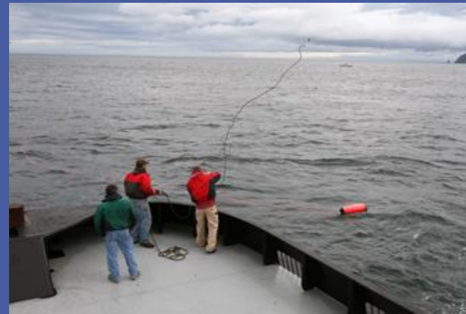
Ship to Tug