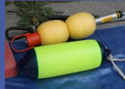
Lighted Pick-up & Thimble Buoy